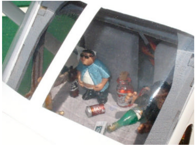
Here's a closeup of the cockpit of one of Bill's airplanes.