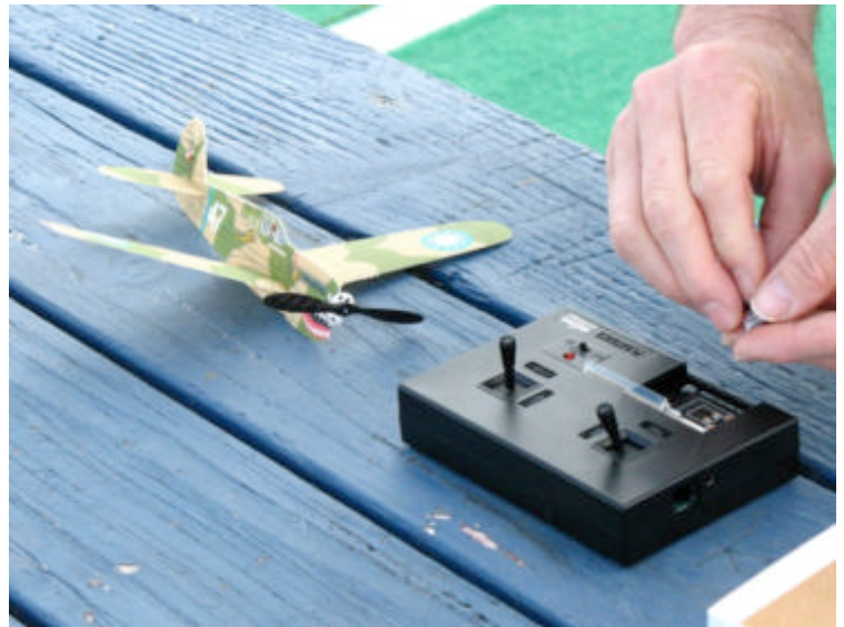
This is the transmitter that came in the plane's package.

Help make the newsletter and website better: take pictures and send them in! Want to learn how? Check out this helpful page: How to Send Photos.