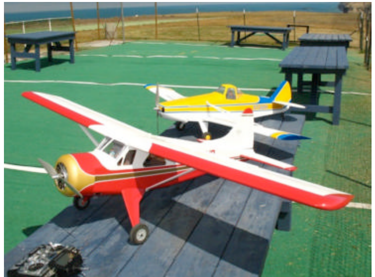
Here are two of Bill K's beautiful airplanes.