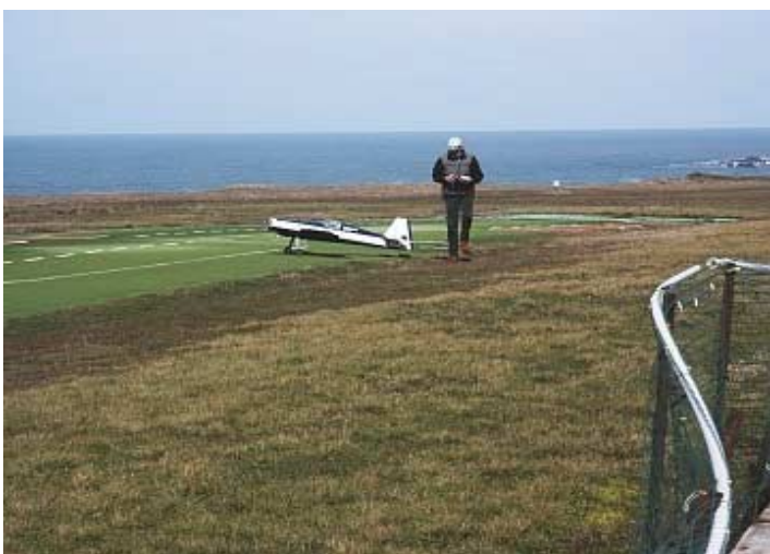
Phil's tail wheel got caught in one of the field mice's holes. Be careful because the holes could rip your landing gear off.