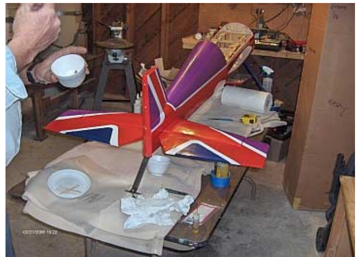
Here's a picture of Grant's new big airplane. A BME 'Yak'. I think it's a 30% and it's light with the DA-50. Grant hopes to bring it to the next meeting. So be there!