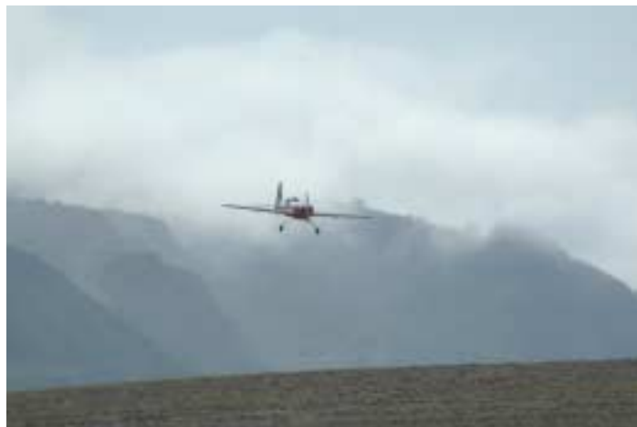
Walt's Extra lined up on final approach. Stay above the Hill south of the ravine. Guys have hit it several times.

You can view these in color at www.flypcc.org