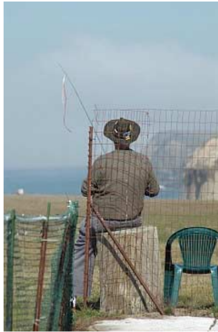
Ed Daum flying. Or is he fishing?