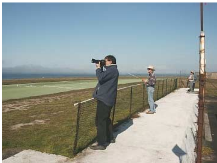
It was such a beautiful day that Brian brought out his big camera to take some pictures. See page 7 for photos.