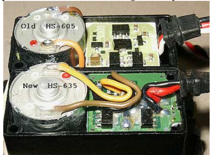
635's replaced the 605's. Notice the wires do not contact the pc board, eliminating chafing.