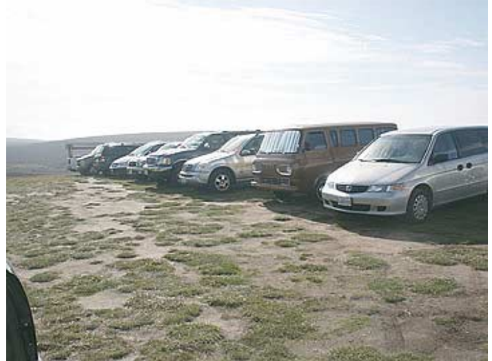
Even though it rained a lot, we had some beautiful day. a lot of guys took advantage of the dry days.