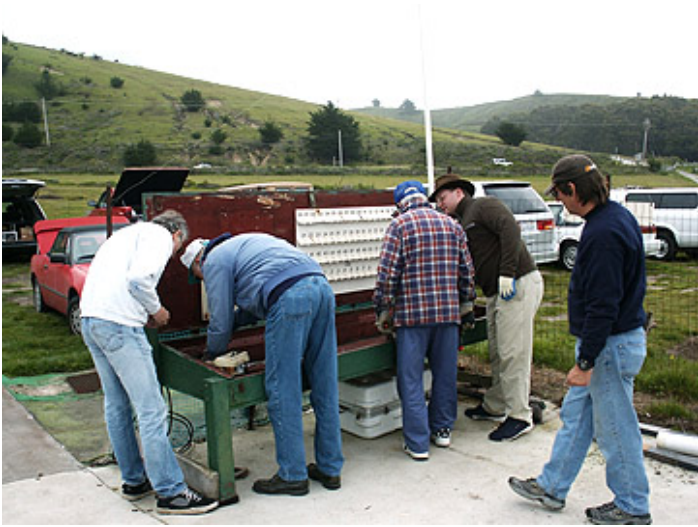
The guys preparing to destroy our old impound box. We'll miss those pesky mice.