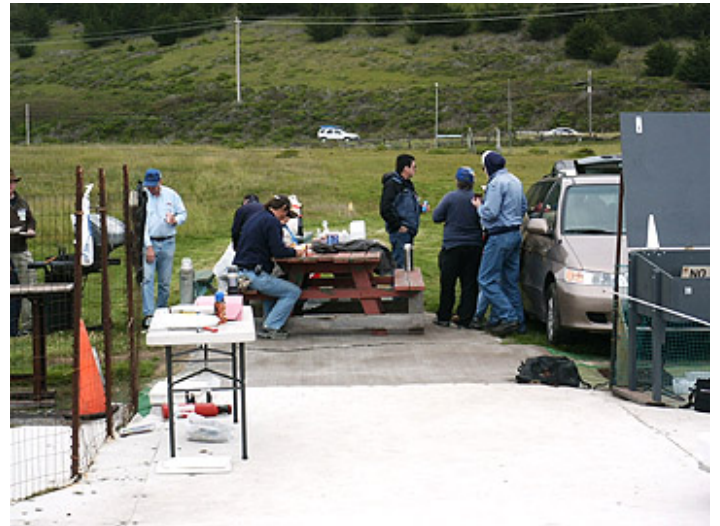
The guys taking a break after having lunch