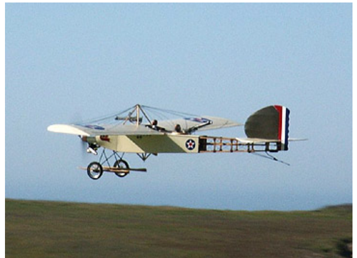
Ed Bussing's beautiful classic antique.

You can view these in color at www.flypcc.org