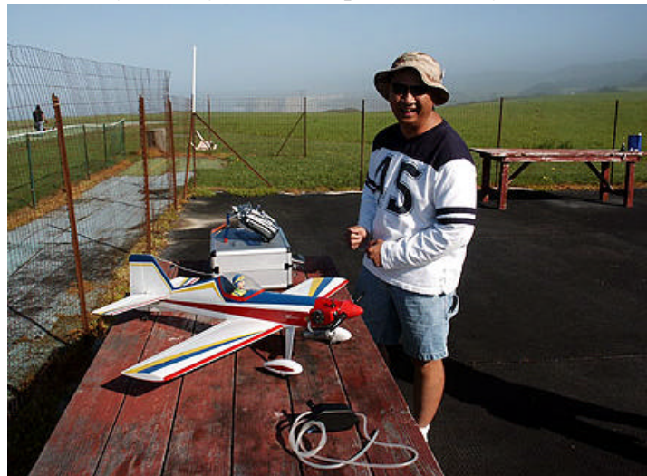
Poor rich. This plane flies nicely when the power is on but the engine quit and it fell out of the sky like a rock.