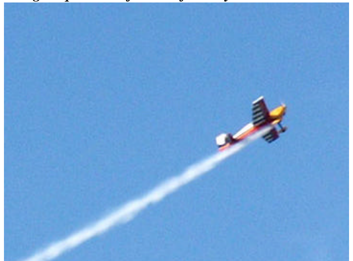
Grant's Wildhare Edge smoking up the sky.