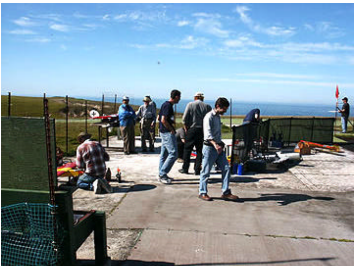
Monday was a beautiful day. Sunshine, light winds. It got kind of crowded.