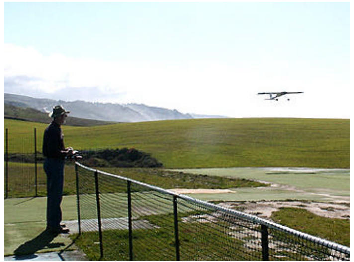
Landing was a piece of cake. Look how beautiful the weather looked.