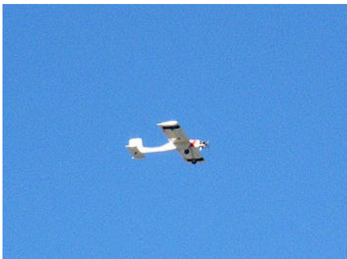
Up into the air... but interference.