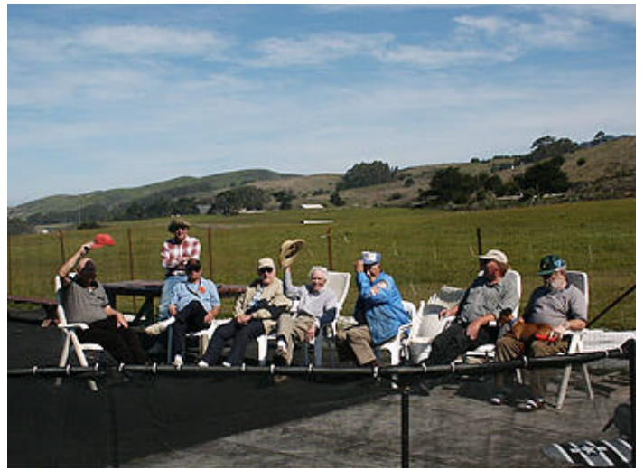
Here are the week-day warriors. Seems like a larger crowd during the week days.