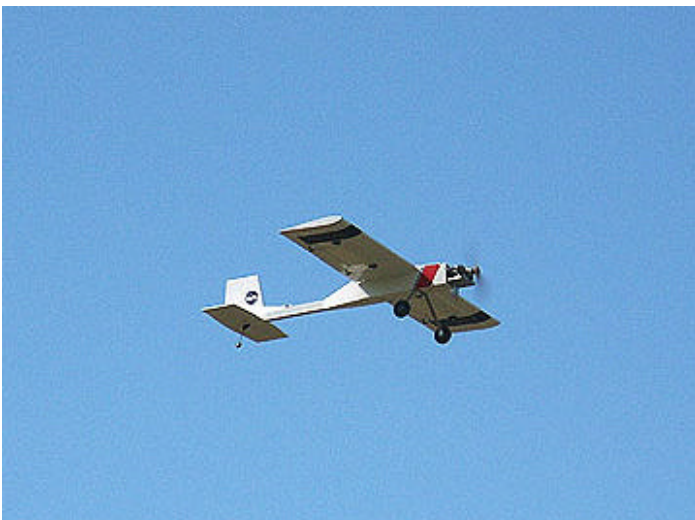
The second flight (on different day) went off without a glitch.