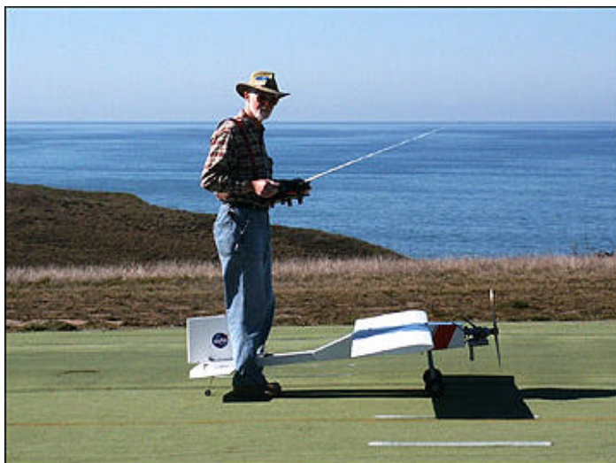
This is it, Harry. I could hear his heart pounding.