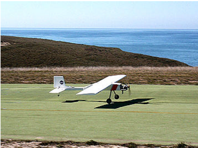
Harry got it down without a scratch after only one circuit around the field.